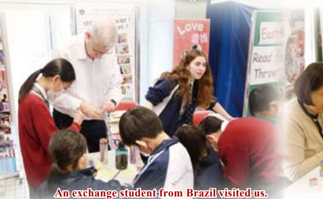
An exchange student from Brazil visited us. Let's talk to her!