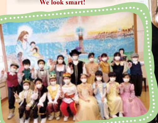
Our actors cannot wait to start their performance!