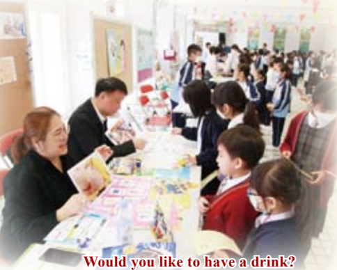
Would you like to have a drink?