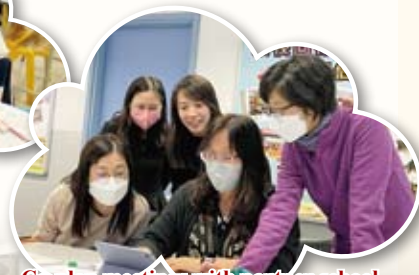
Co-plan meetings with partner school