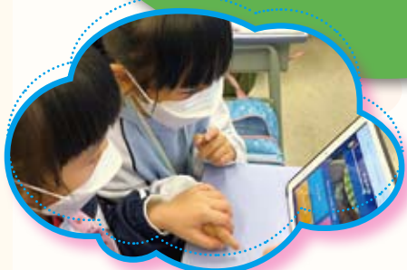
Peer learning can cater for individual differences.