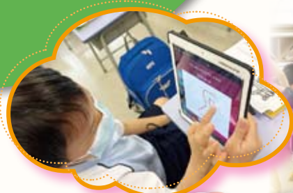
Students read and draw on Quizizz.