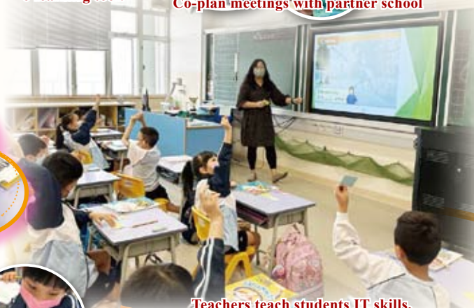
Teachers teach students IT skills.