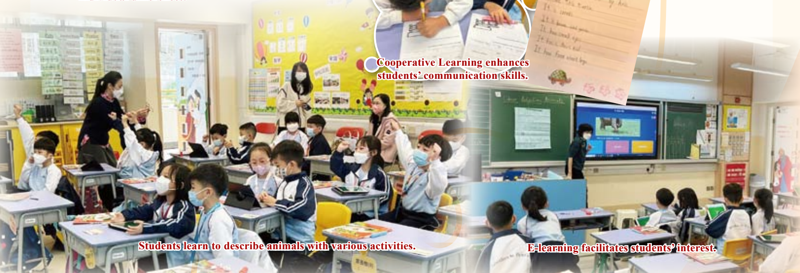
Students learn to describe animals with various activities.