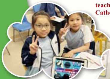
We can learn English through the e-learning tool!