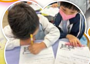
Cooperative Learning enhances students' communication skills.