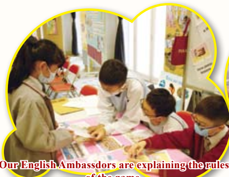
Our English Ambassadors are explaining the rules of the game.