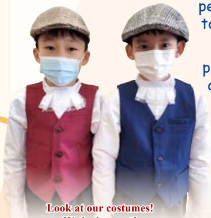
Look at our costumes! We look smart!

Once again, congratulations to the students who performed and to everyone involved in the play. We are proud of them and wish them the best in their future endeavours!