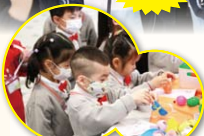
Our little friends from the kindergartens enjoyed making their own Easter eggs.