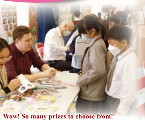
Wow! So many prizes to choose from!