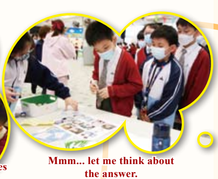
Mmm... let me think about the answer.